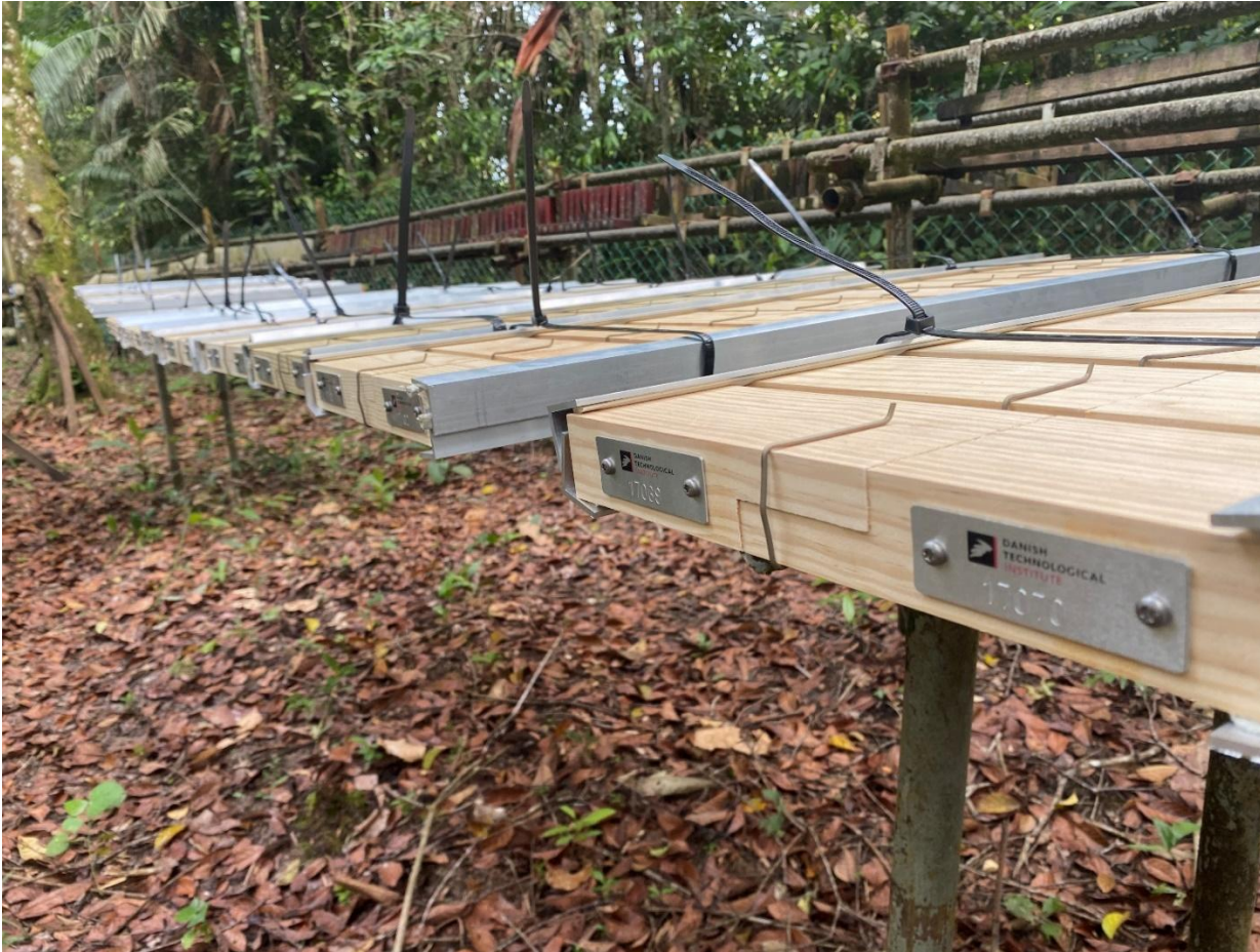
Figure 1: Exposure of the CEN/TS 12037 samples (lap-joints) at the UNIMAS test site in Malaysia