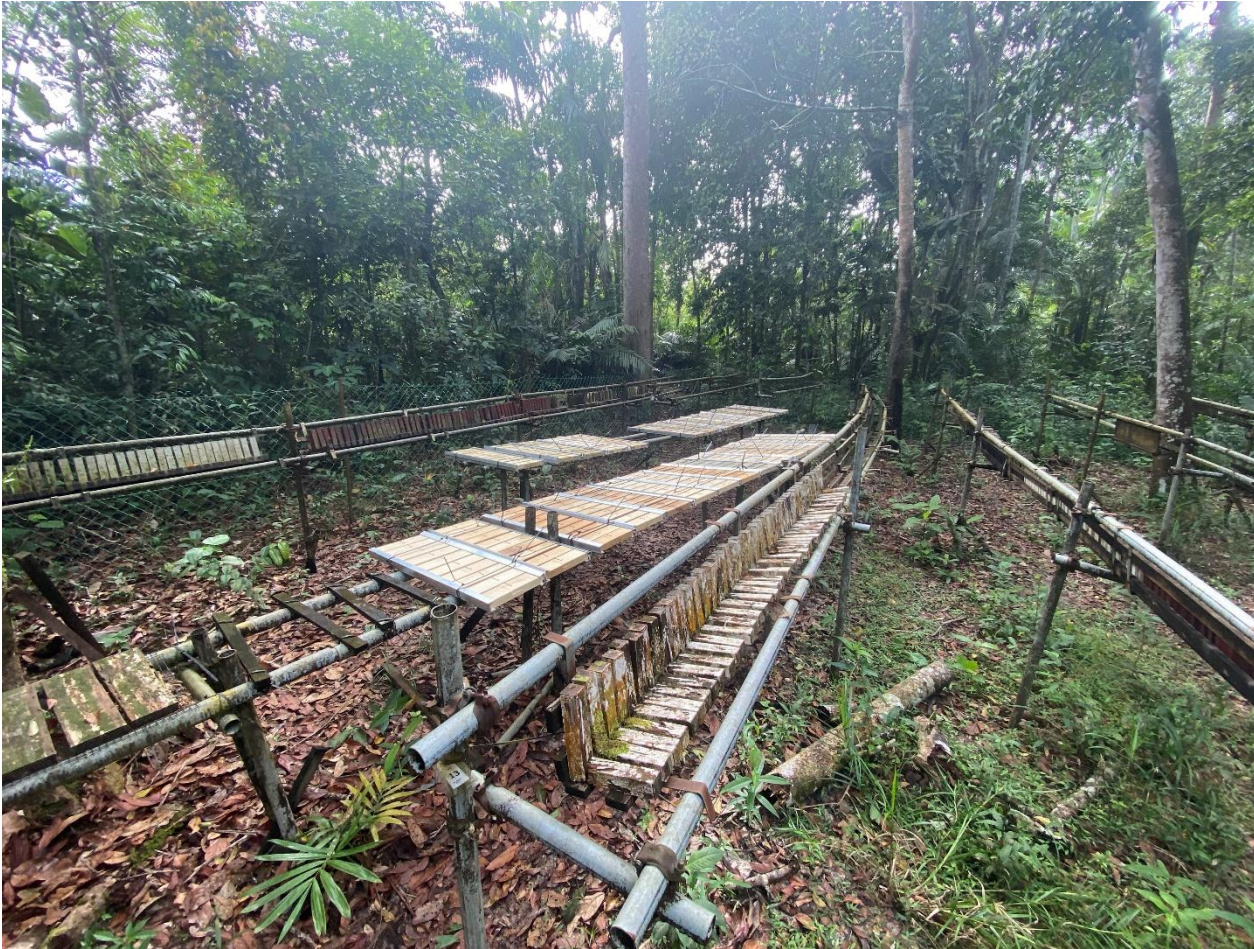
Figure 2: Exposure of the CEN/TS 12037 samples (lap-joints) at the test site in Malaysia