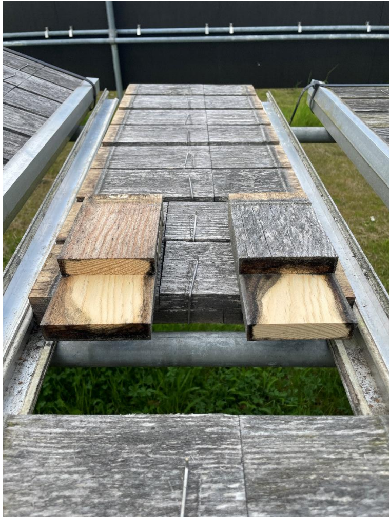
Figure 2: Exposure of the CEN/TS 12037 samples (lap-joints) at the DTI test site in Taastrup, Denmark (left) and NOWA samples in detail, lap-joint clapped open (Photos from May 2026)