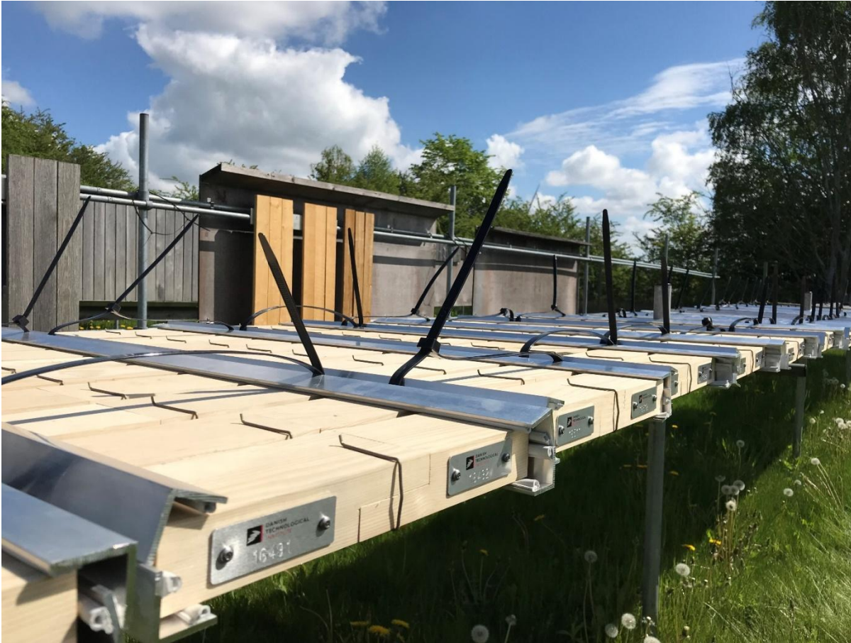
Figure 1: Exposure of the CEN/TS 12037 samples (lap-joints) at the DTI test site in Taastrup, Denmark (Photo from exposure in 2021)