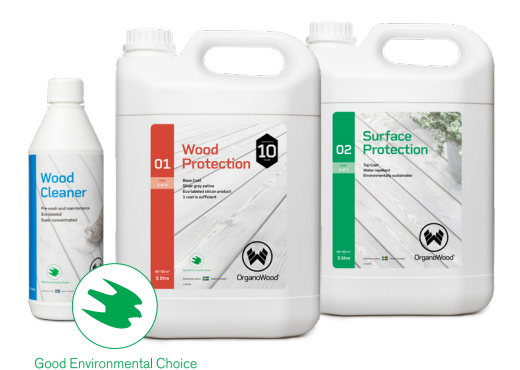
The complete Wood Protection System consists of Wood Cleaner (pre-wash and maintenance wash), 01 Wood Protection (base coat) and 02 Surface Protection (top coat). 01 Wood Protection and Wood Cleaner are eco-labelled with the Swedish Society for Nature Conservation's "Good Environmental Choice".

Maintenance washing with OrganoWood® Wood Cleaner is recommended. If the surface is mechanically worn, for example where people often walk or move furniture, or if the surface is washed with a strong wood cleaner or high-pressure washing (should be avoided), the wood fibres in the surface layer may be worn away and thus also the treatment. If necessary, re-treat with 02 Surface Protection. Following significant wear or heavy-duty cleaning, worn sections may also need to be re-treated with 01 Wood Protection.