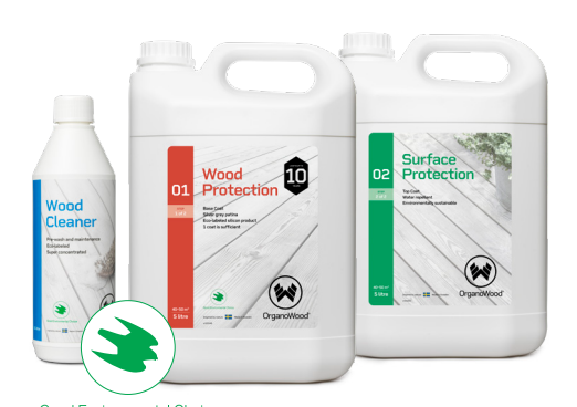
The complete Wood Protection System consists of Wood Cleaner (pre-wash and maintenance wash), 01 Wood Protection (base coat) and 02 Surface Protection (top coat). 01 Wood Protection and Wood Cleaner are eco-labelled with the Swedish Society for Nature Conservation's "Good Environmental Choice".

Maintenance washing with OrganoWood® Wood Cleaner is recommended. If the surface is mechanically worn, for example where people often walk or move furniture, or if the surface is washed with a strong wood cleaner or high-pressure washing (should be avoided), the wood fibres in the surface layer may be worn away and thus also the treatment. If necessary, re-treat with 02 Surface Protection.