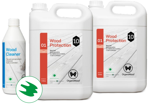
Good Environmental Choice

OrganoWood® makes your old decking nice again, reduces the need for maintenance, and extends the natural lifespan of the wood.