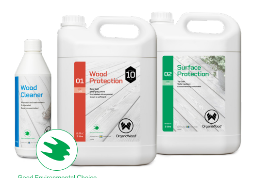
The complete Wood Protection System consists of Wood Cleaner (pre-wash and maintenance wash), 01 Wood Protection (base coat) and 02 Surface Protection (top coat). 01 Wood Protection and Wood Cleaner are eco-labelled with the Swedish Society for Nature Conservation's "Good Environmental Choice".

Maintenance washing with OrganoWood® Wood Cleaner is recommended. If the surface is mechanically worn, for example where people often walk or move furniture, or if the surface is washed with a strong wood cleaner or highpressure washing (should be avoided), the wood fibres in the surface layer may be worn away and thus also the treatment. If necessary, re-treat with 02 Surface Protection.