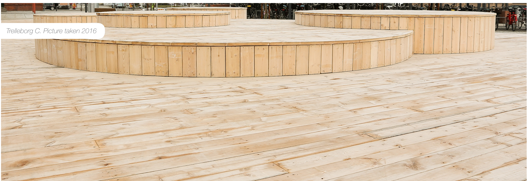
Trelleborg C. Picture taken 2016

Timber that is placed outdoors turns grey naturally but the greying process can appear differently during the seasons and depending on the weather conditions. In some cases the greying may initially be perceived as speckled or as dark spots/fields, but this evens out relatively quickly. After about 1 year an OrganoWood® timber that is placed outdoors in direct sunlight already has a grey hue. In shadow this may take longer, but the end result is the same. Wood installed horizontally often has a faster greying process than wood installed vertically