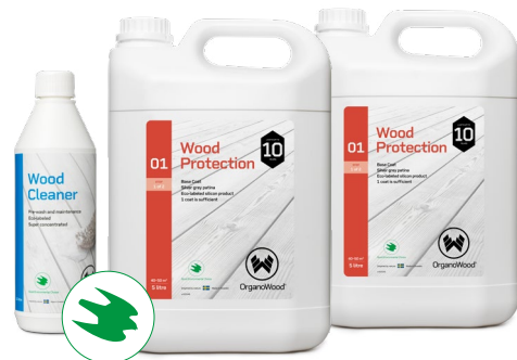
Good Environmental Choice

OrganoWood® makes your old decking nice again, reduces the need for maintenance, and extends the natural lifespan of the wood.