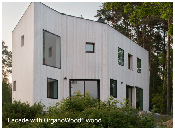
Facade with OrganoWood® wood.

01 Wood Protection and Wood Cleaner are eco-labeled with the Swedish Society for Nature Conservation's "Good Environmental Choice". 01 Wood Protection and 02 Surface Protection are listed in the Swan Ecolabel Building Product Portal and can be used in Swan eco-labeled buildings. All products have environmental classification B with SundaHus and are recommended by Byggarverbedömningen and BASTA.