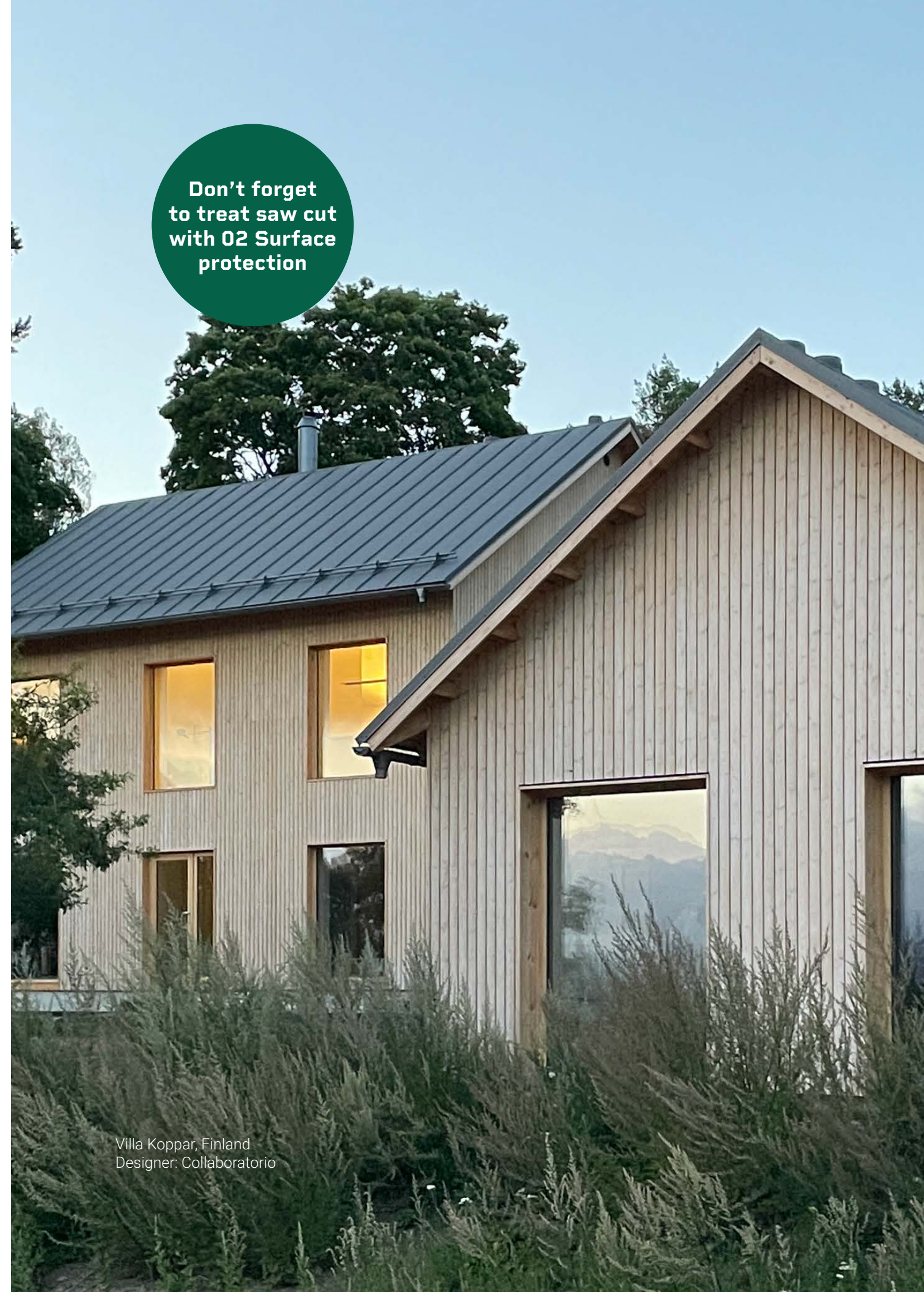
Villa Koppar, Finland Designer: Collaboratorio

Don't forget to treat saw cut with 02 Surface protection